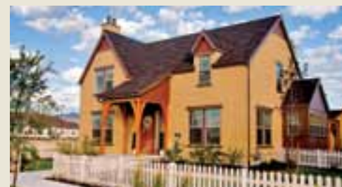
Garden Park (A low-maintenance, 55+ village) Ivory Homes Estate Home Series A – starting in the mid $300s.

Ivory Homes Estate Home Series B – starting in the high $300s.