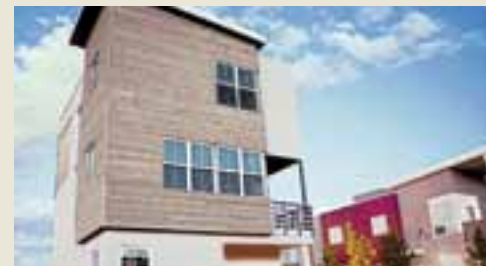
Holmes Homes Coach House Starting in the high $100s.

Six homes that were created by Daybreak builders for the Parade of Homes have been added to our list of standing model homes.