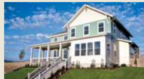
Rainey Homes Single Family Starting in the high $300s.