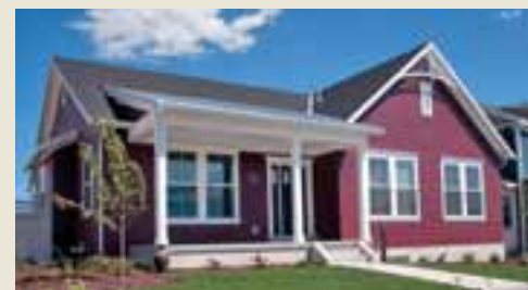
Bangerter Homes Single Family Starting in the high $200s.