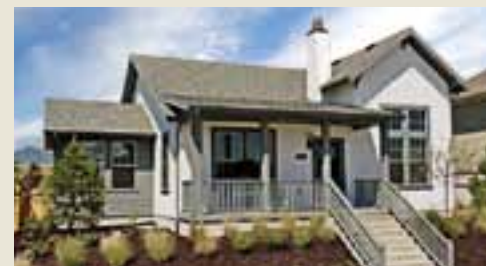
Destination Homes Estate Series Starting in the mid $300s.